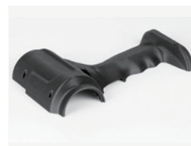
Electrical and electronics (E&E) industry