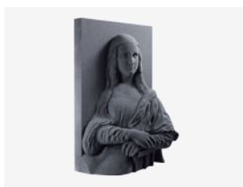
Art and sculpture