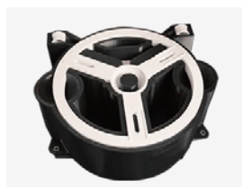
Jigs & Fixtures