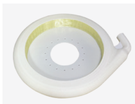
Prototyping and design